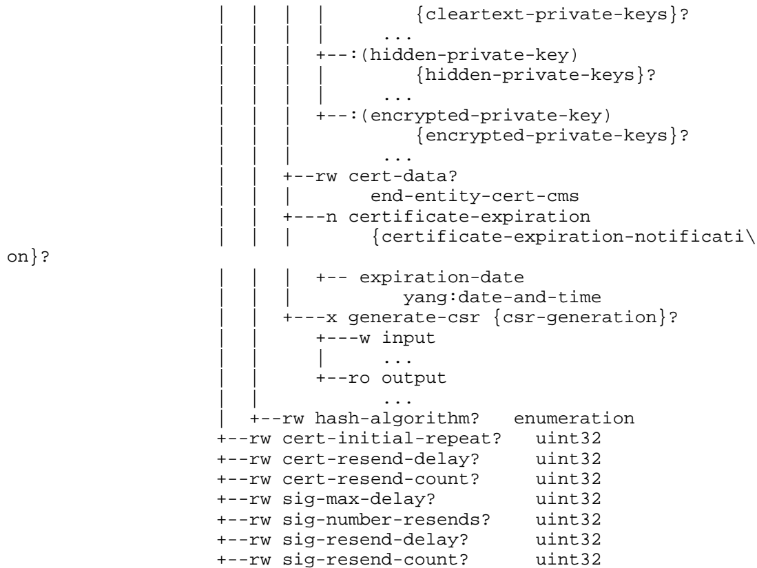
Figure 2: Tree Diagram for Syslog Model