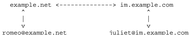
Figure 1: Distributed Client-Server Architecture

associated with the server <im.example.com> might be able to exchange messages, presence, and other structured data with the user <romeo@example.net> associated with the server <example.net>. This pattern is familiar from messaging protocols that make use of global addresses, such as the email network (see [SMTP] and [EMAIL-ARCH]). As a result, end-to-end communication in XMPP is logically peer-to-peer but physically client-to-server-to-server-to-client, as illustrated in the following diagram.