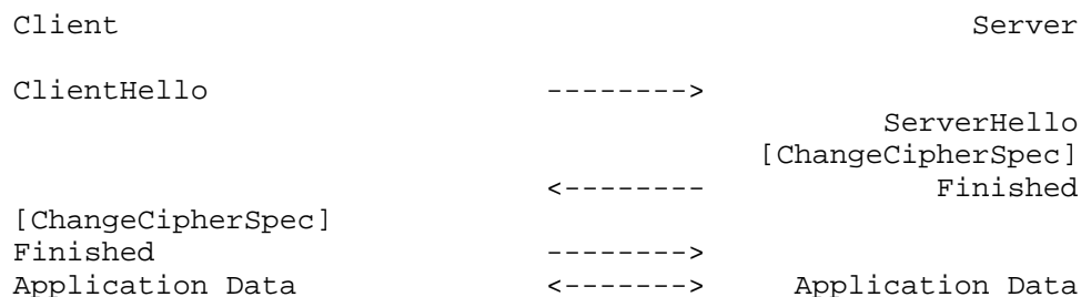
Fig. 2. Message flow for an abbreviated handshake

If a match is found, and the server is willing to re-establish the connection under the specified session state, it will send a ServerHello with the same Session ID value. At this point, both client and server MUST send change cipher spec messages and proceed directly to finished messages. Once the re-establishment is complete, the client and server MAY begin to exchange application layer data. (See flow chart below.) If a Session ID match is not found, the server generates a new session ID and the TLS client and server perform a full handshake.