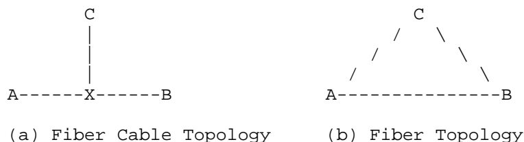
Figure 6-2. Fiber Cable vs Fiber Topologies

The imminent deployment of ultra-long (>1000 km) Optical Transport Systems introduces a further complexity: Two OTSes could interact a number of times. To make up a hypothetical example: A New York - Atlanta OTS and a Philadelphia - Orlando OTS might ride on the same right of way for x miles in Maryland and then again for y miles in Georgia. They might also cross at Raleigh or some other intermediate node without sharing right of way.