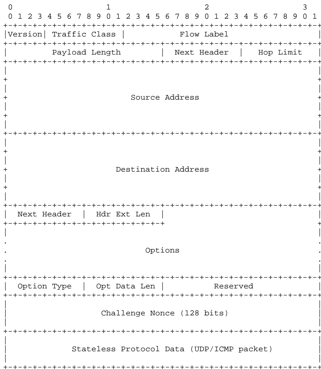
Figure 2: The IPv6 Challenge Packet with Challenge-Confirm Option

The fields in the Challenge-Confirm Option are defined as follows: