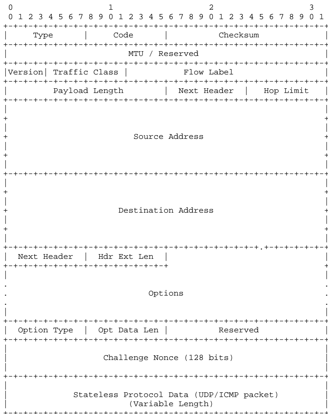
Figure 3: New ICMPv6 Error Responding to the Challenge Packet