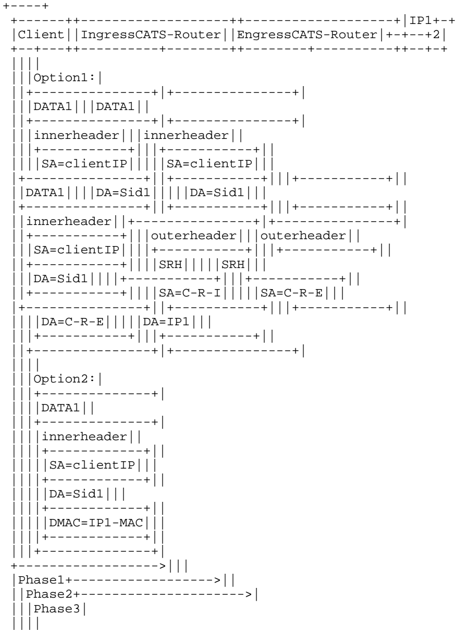
Figure 4: CATS Dataplane Workflow For solution 3

Figure 4 illustrates successive phases of workflow in Solution 3